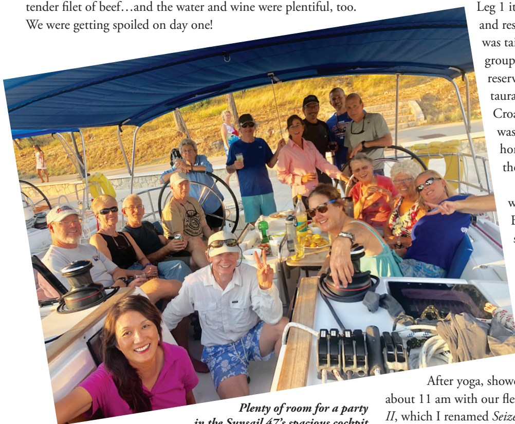
Plenty of room for a party in the Sunsail 47's spacious cockpit