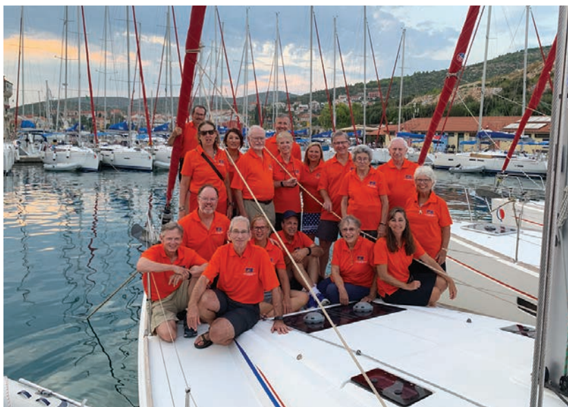
Colgate Sailing Adventures Croatia Flotilla participants gather for a group photo in Dubrovnik.

After making the navigation rounds by dinghy, we dropped moorings and headed toward Peljeski Kanal, past stunning scenery, then past Korčula town. We saw all manner of watercraft from small wooden fishing dories to mega power yachts, sleek cata-