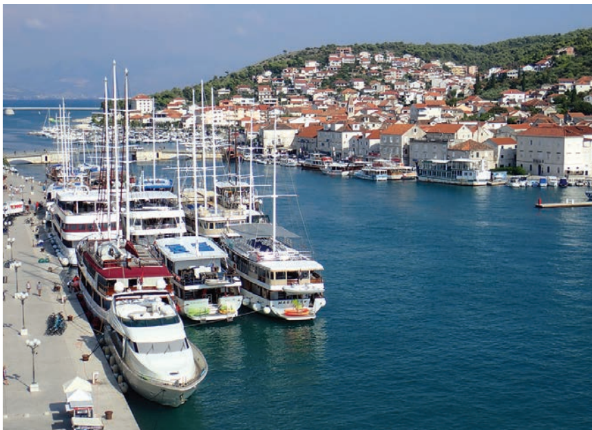
Hvar is one of the loveliest island retreats on the Adriatic.