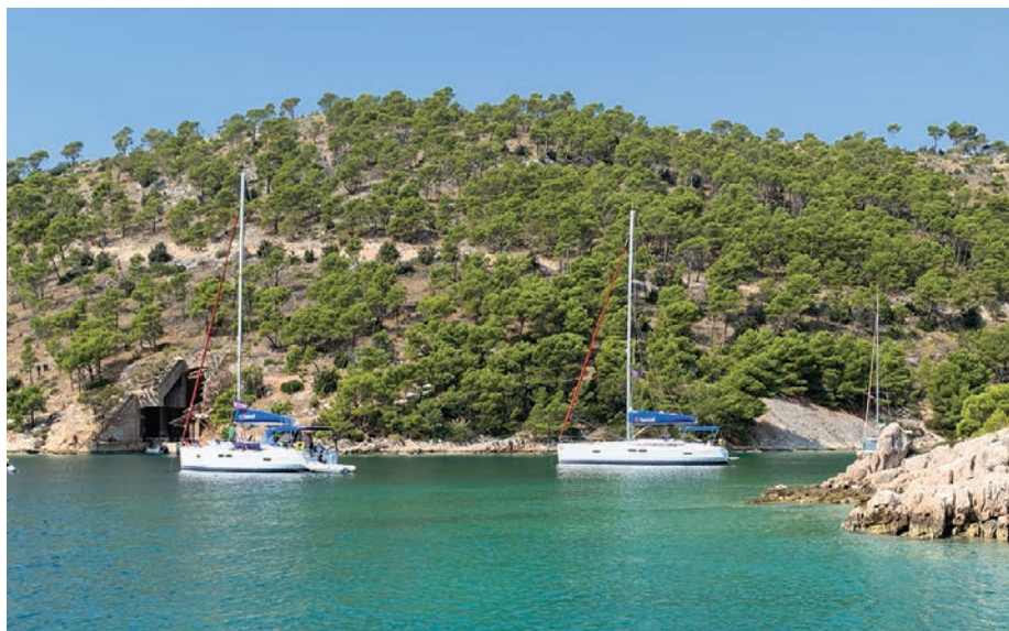
Anchored next to a submarine cave at Uval Smrka on Brac Island

As soon as the wind cooperated, we set sail, testing the monohull's sail handling with some light air upwind work and generally learning the rigging and systems. We dropped the hook at our planned lunch stop for a swim. The water was delightful – clean, refreshing, and a deep Mediterranean blue. After we had our fill, we picked up anchor and rolled our genoas out to sail to Trogir, an ancient seaside town complete with castle and cathedrals. We used our Med mooring skills...which were very good BTW. Then we all headed in to the charming town of Trogir, navigating a cobble maze of walkways through medieval architecture. We met up for a really good group meal at Restaurant Alta. A young duo of waiters served our group well and we enjoyed a really fine meal. We retired to our boats around 11 pm.