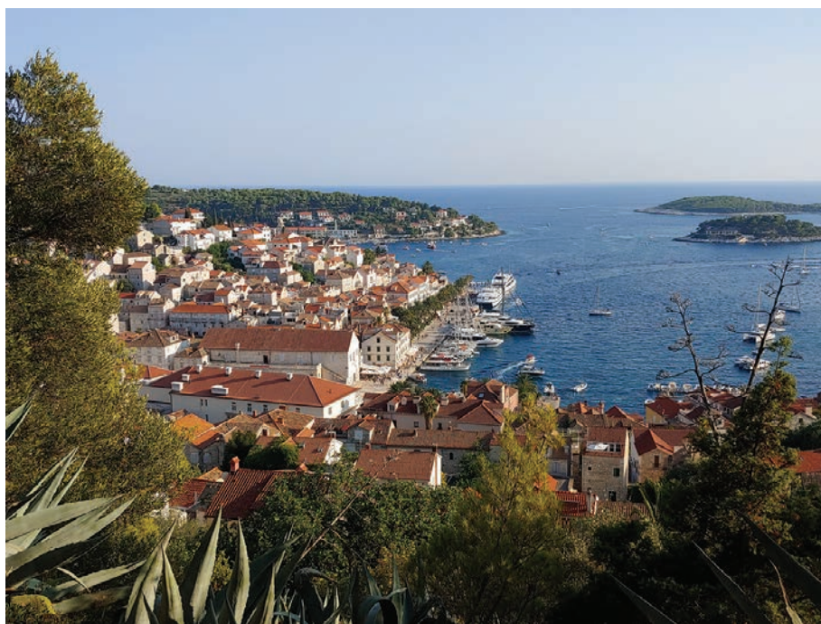
Overlooking Milna Town

The Meet and Greet dinner at La Barca restaurant at Marina Agana kicked Leg 1 of our Colgate Sailing Adventures Croatia Flotilla off to a fun start. The food that Robert, the owner, prepared for our crew was exceptionally fresh and delicious. We started off with plates of cheese and fig with honey, caprese salad, and beef carpaccio among other appetizers. Next came platters of fresh Mediterranean seafood, crispy chicken with sauce, tender filet of beef...and the water and wine were plentiful, too. We were getting spoiled on day one!