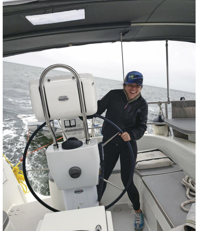
Above: Clarity's turn on the helm was fun in 15-18 knots of breeze.