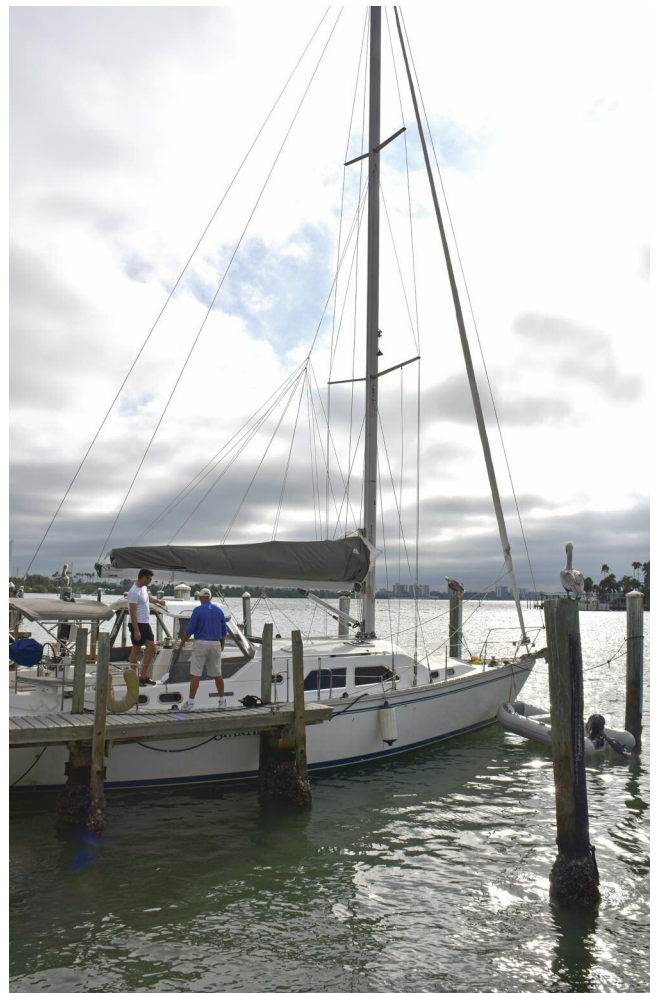
Below: Boat Briefing on the Catalina 44 with the pelicans before we head out on our cruising course.

course and consolidates most of the information. For a non-sailor, this pre-trip reading was essential as it prepares you for the entire course.