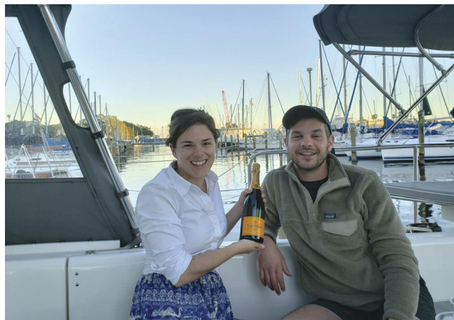
We passed our courses with flying colours and celebrated with Veuve Clicquot.

us a bearing to our destination. We had reserved a slip for overnight and I was mentally preparing to dock the 44-ft boat with no bow thrusters. Hunter showed me how to create engine wash to nail the docking.