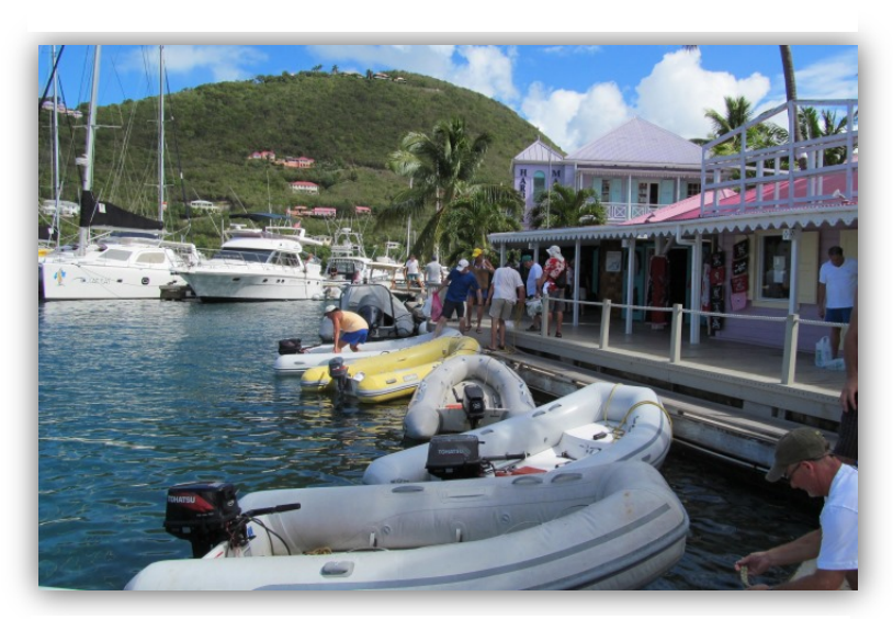
A stop at a Pusser's Rum store