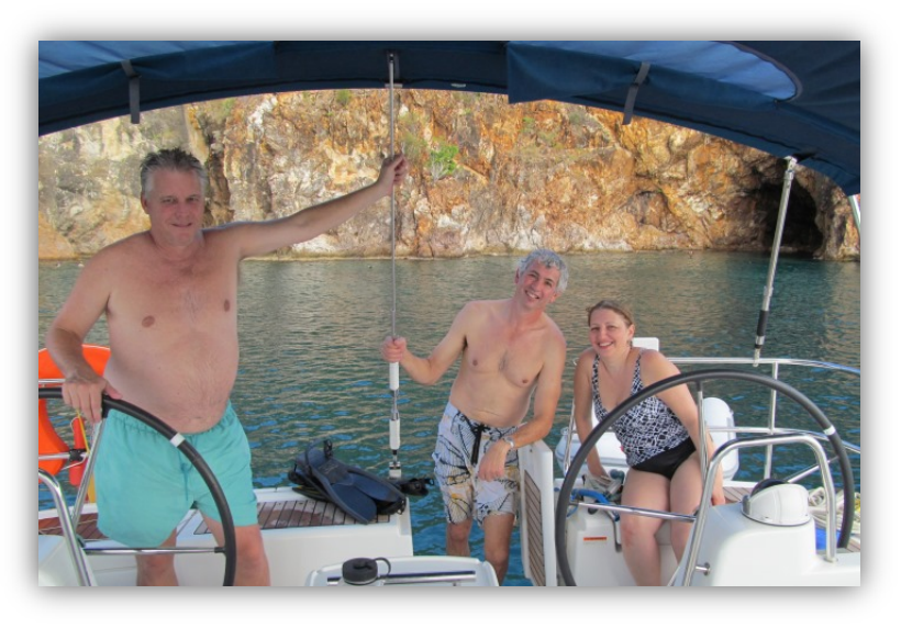
The Caves at Treasure Point off Norman Island