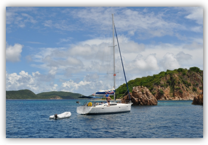
Moorings 433 at The Indians