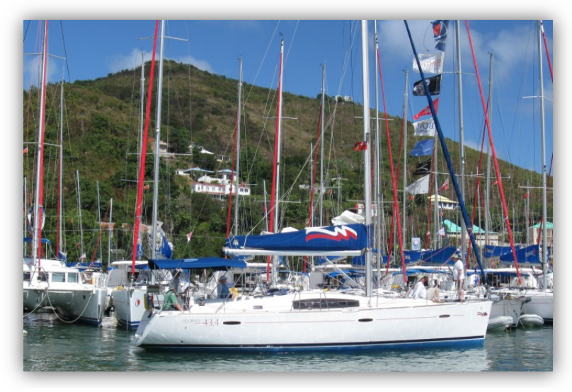
A Moorings 434 – our fleet has five three cabin 433s

Board boats late afternoon at The Moorings base on Wickham's Cay, get acquainted with crew mates at one of the local eateries, store provisions if they have arrived (sometimes they come the next morning), spend that night aboard at the marina.