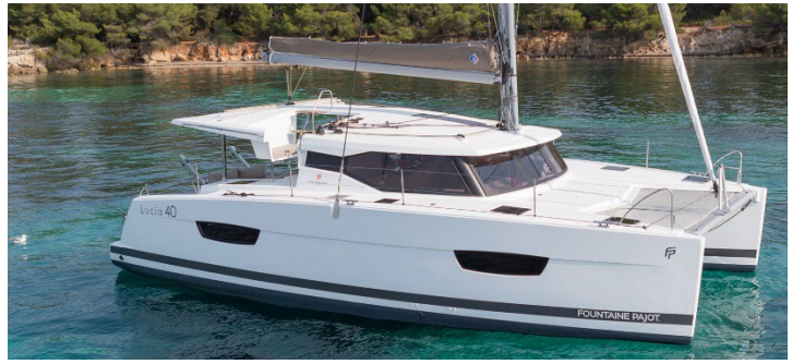
Fontaine Pajot Lucia 40 – A Fun 4-Cabin Catamaran