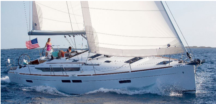
The Jeanneau 479 – A Lively Four Cabin Monohull